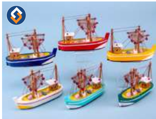
14213 Mini Trawler with Hanging Nets, 13x8cm, 6 ass.