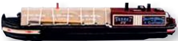
14396A Working Canal Boat "Small Ferret", 20cm.