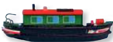
21605B Canal Boat Magnet, Leisure Boat.