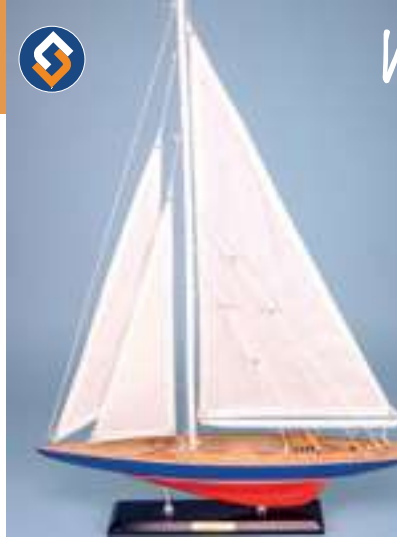
14046B J Class Endeavour, 67x51cm.