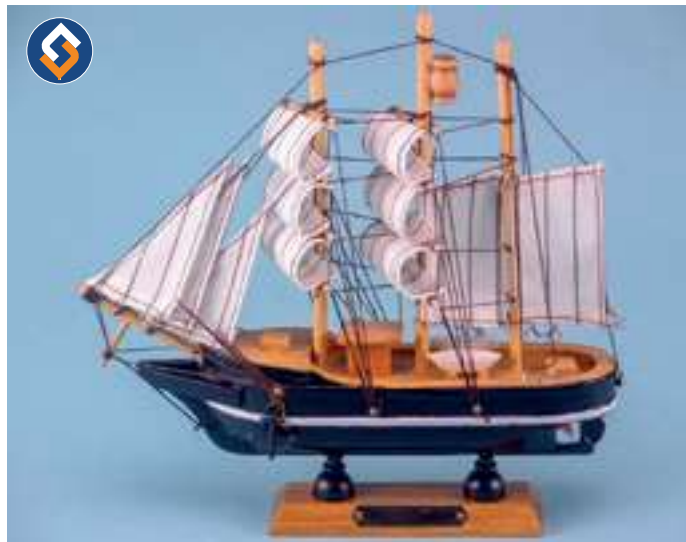
14160 Discovery, 20x20cm.