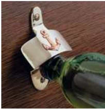
4387 Wall Mounted Bottle Opener.

Solid brass bottle opener with raised anchor design and two mounting holes for secure attachment to a wall or bulkhead. An accessory that can be appreciated (and is useful) in a multitude of locations, and won't get lost! Height 9cm, width 6cm.