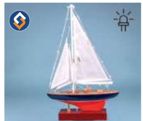
14068 Yacht 25cm with LED Lights.