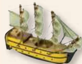
6906 HMS Victory, 12cm.