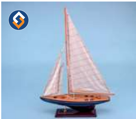
14040 J-Class Yacht, 42x60cm.