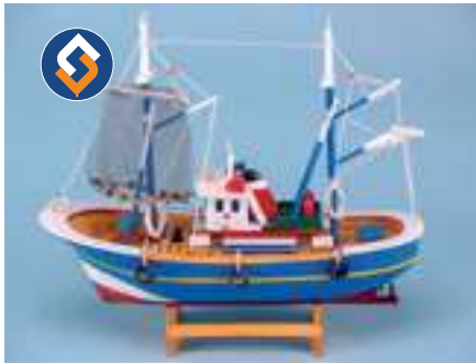
14224 Blue Trawler with Hanging Nets, 30x27cm.