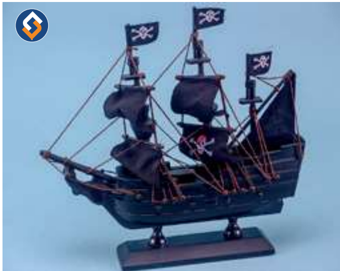
14120 Pirate Ship, black, 20x20cm.