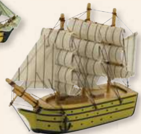
7485 HMS Victory Model, 20cm.