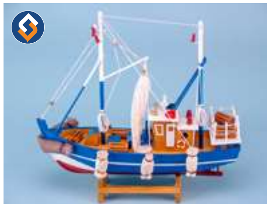
14223 Blue Crab Boat, 30x28cm.