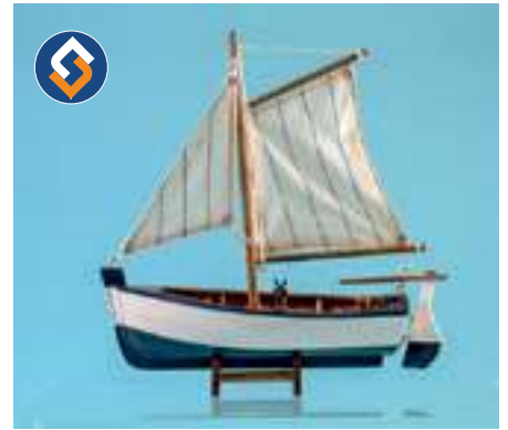
14022 Sail Boat with Oars, 22x22cm.