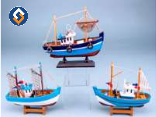
14217 Trawler Assortment, 16cm, 3 assorted.