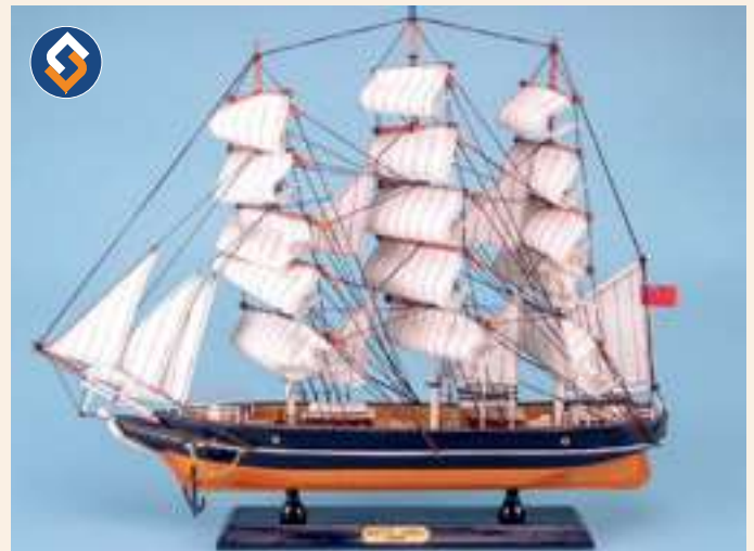
14193 Cutty Sark, large, 46x38cm.