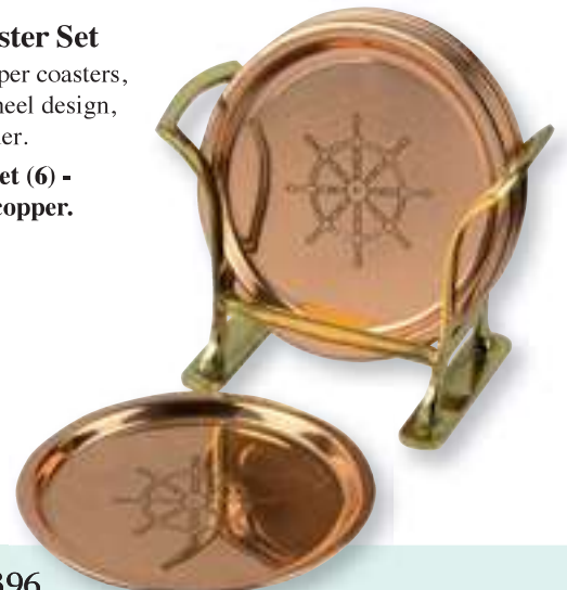
2940 Coaster Set (6) - Ship's Wheel, copper.

A set of six copper coasters, with a ship's wheel design, and a brass holder.