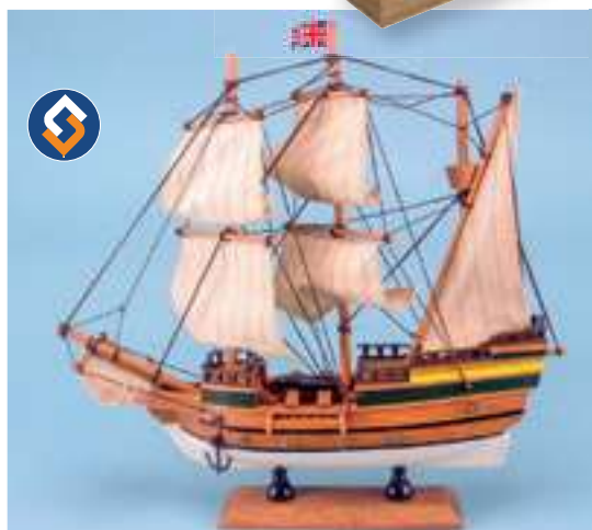
14156 Mayflower, small, 33x33cm.