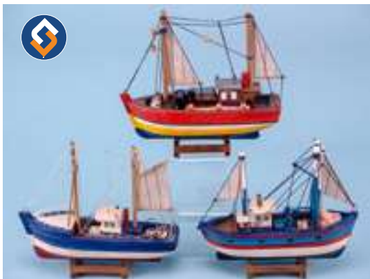
14220 Trawler Assortment, 14x15cm, 3 assorted.