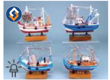
14240 Trawler 20cm with LED Lights, 4 assorted.