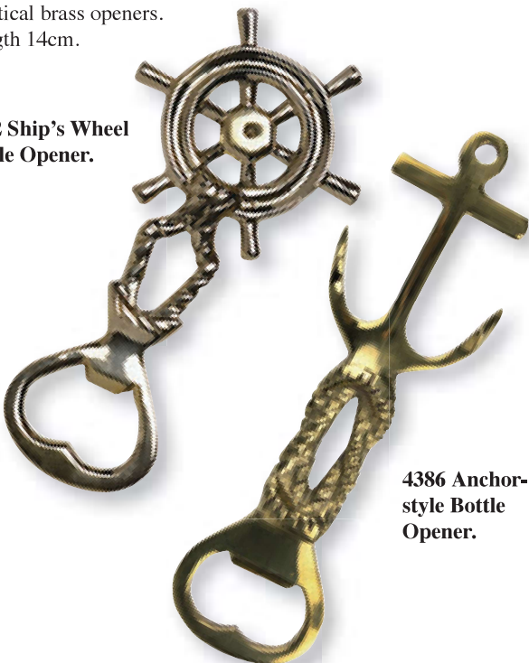
4386 Anchor-style Bottle Opener.