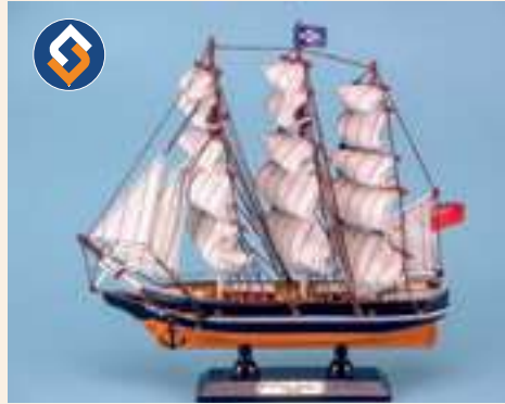
14191 Cutty Sark, small, 24x22cm.