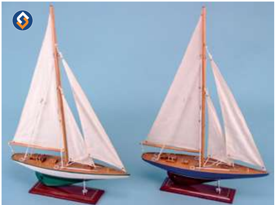
14044 J Class, 36x52cm, 2 assorted.