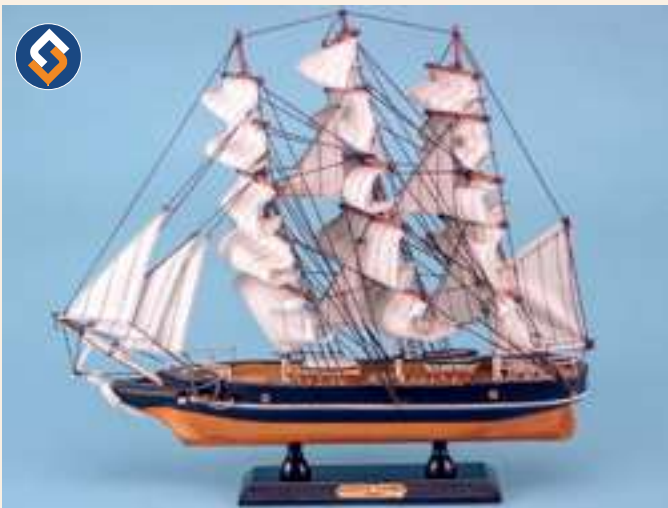
14192 Cutty Sark, Medium, 32x30cm.