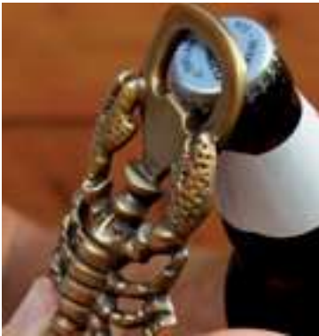
New! 7292 Lobster Bottle Opener, Antique Finish.