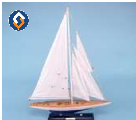
14046 J Class Enterprise, 67x51cm.