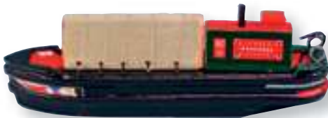
14399A Mini Canal Boat, Working Version 10cm.