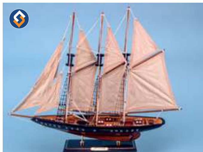
14065 3 Mast Yacht, 60x58cm.