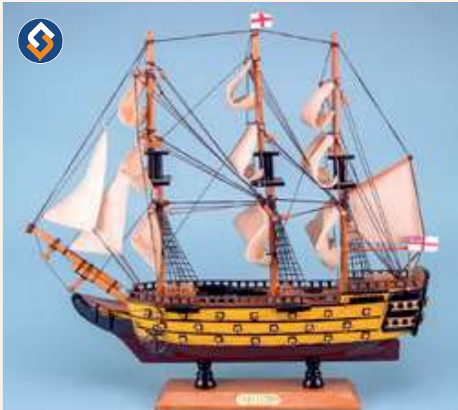
14183 HMS Victory, large, 46x46cm.