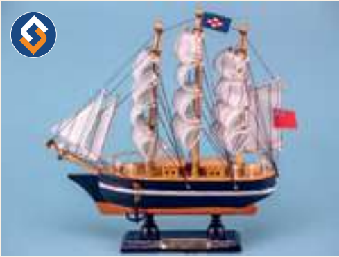
14195 Cutty Sark, Mini, 20x20cm.