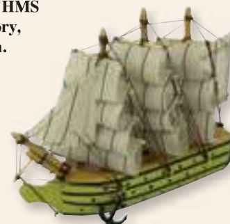
6907 HMS Victory, 16cm.