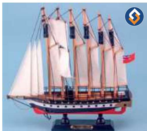
14108 SS Great Britain, 24cm.