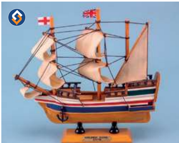
14168 Golden Hind, 20x20cm.