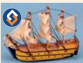
14189V Flat Bottom Victory, Micro, 12cm.

Please note these products are not linked to the National Museum of the Royal Navy