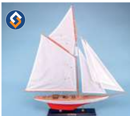
14057 Colombia, 60x60cm.