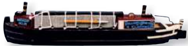
14396E Canal Boat, "Mendip", 20cm.