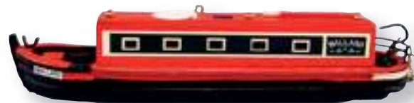
14396C Leisure Canal Boat "Small Mallard", 20cm.