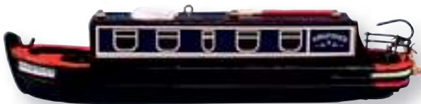
14396D Leisure Canal Boat, "Small Kingfisher", 20cm.