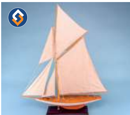
14041 Varnished Yacht Bowsprit, 80x94cm.