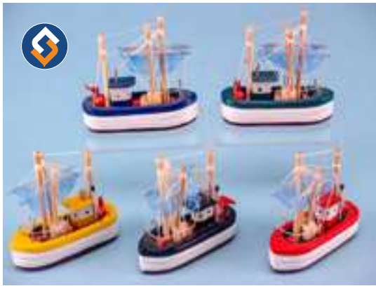
14209 Fishing Boat, Miniature, 7x7cm, 5 assorted.