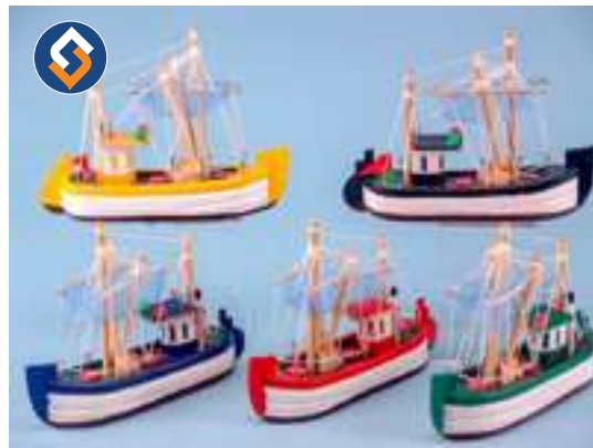
14211 Fishing Boat, Medium, 12x10cm, 5 assorted.