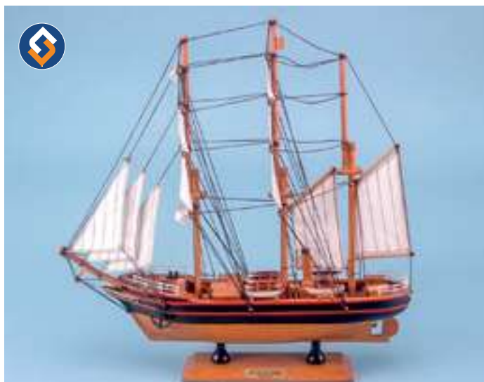
14158 Discovery, 33x33cm.