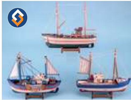
14239 Distressed Finish Trawler Asst, 24cm x22cm, 3 assorted.