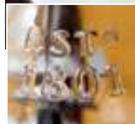
2990 HMS Victory Ship-in-Bottle, 22cm.