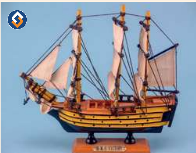
14163 HMS Victory, mini, 20x20cm.