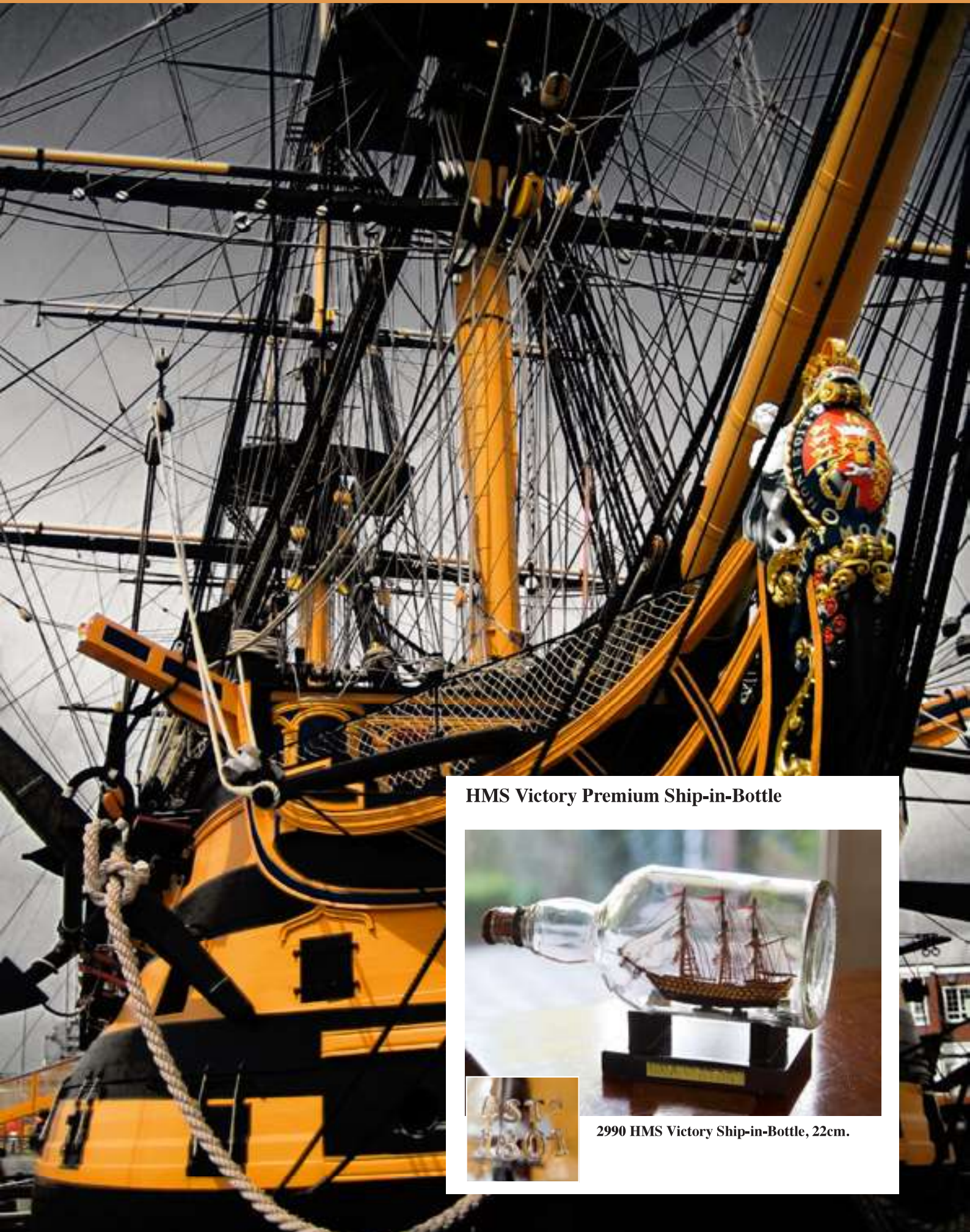
HMS Victory Premium Ship-in-Bottle