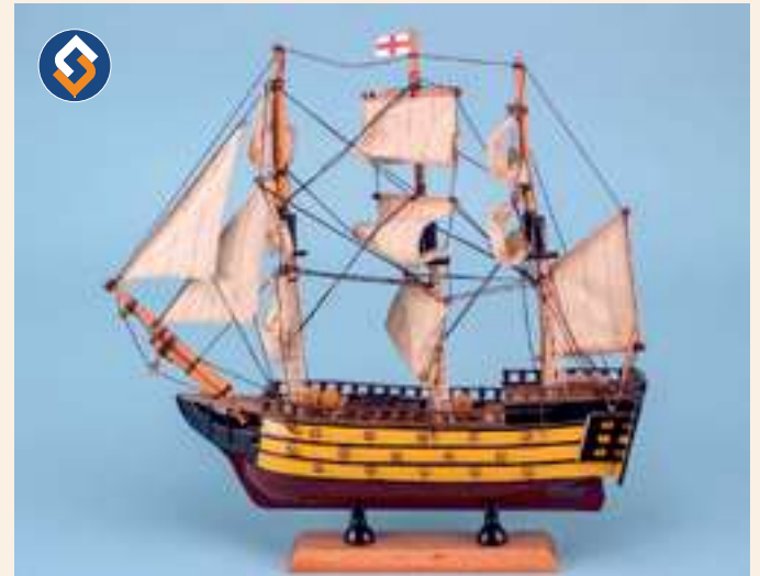
14181 HMS Victory on Stand 33x33cm.