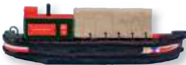
21605A Canal Boat Magnet, Working Boat.