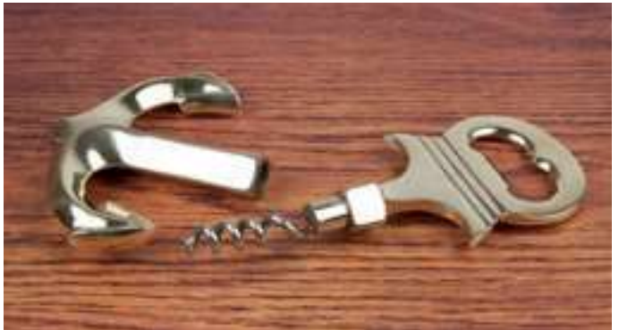
7297 Anchor-shaped Bottle Opener & Corkscrew, 15cm.

Bottle cap remover and corkscrew in one. The flukes of the anchor give a good purchase on stubborn corks. Chunky polished brass castings with stainless steel 'worm' (corkscrew thread). Length 15cm.