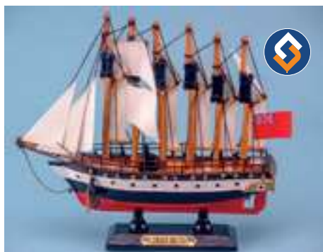
14105 SS Great Britain, 20x18cm.