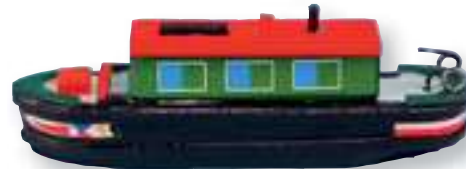
14399B Mini Canal Boat, Leisure Version, 10cm.