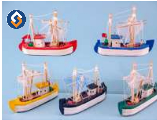
14210 Fishing Boat, small, 10x8cm, 5 assorted.