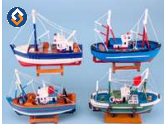
14218 Fishing Boat Assortment, 18x18cm, 4 assorted.