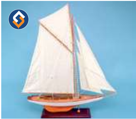
14063 Lulworth Style Yacht, 65x72cm.