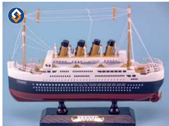
14144 Titanic, 20x16cm.