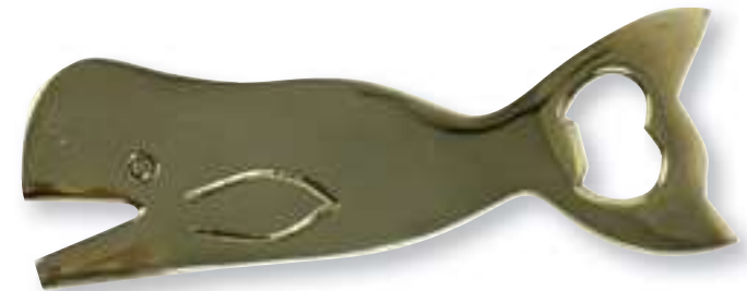
3820 Whale Bottle Opener, brass, 19cm.