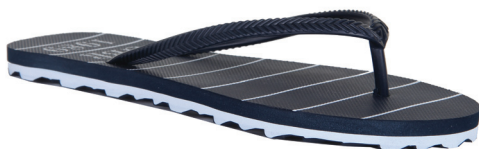
Navy / Navy