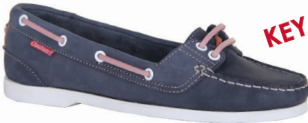
Navy / Pink