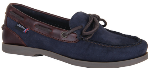
Navy / Seahorse