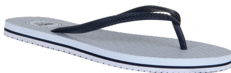
White / Navy