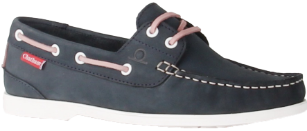
Navy / Pink