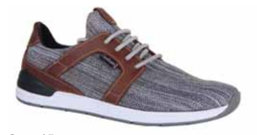
Grey / Tan

Stretchknit upper with leather facings on a TPR and EVA sole,