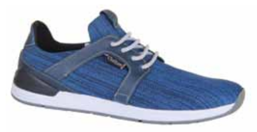
Blue / Navy