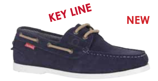
SOL ≅ SPRING