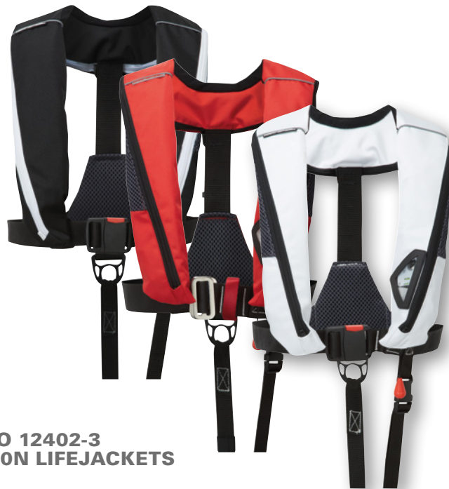
ISO 12402-3 150N LIFEJACKETS