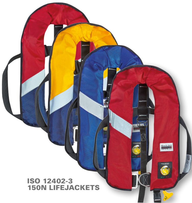
ISO 12402-3 150N LIFEJACKETS