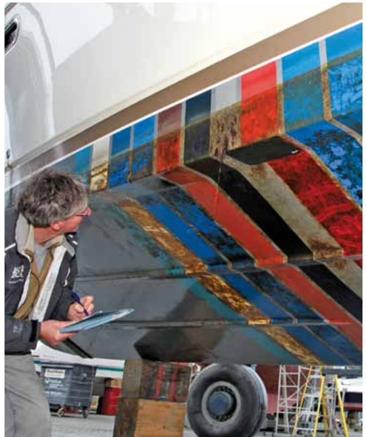
Mark examines the slime build-up on Blue Fin