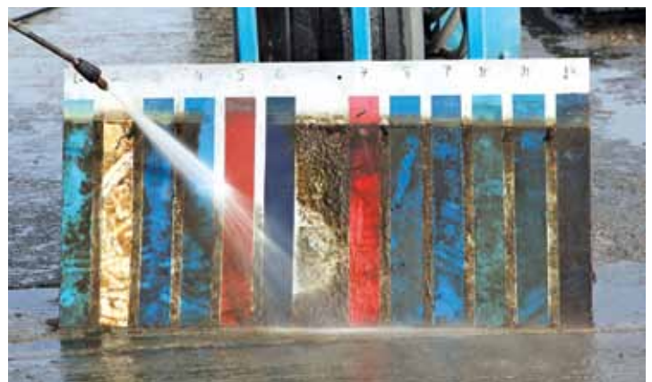
Washing the slime off our static test panel – which paint was the most effective?