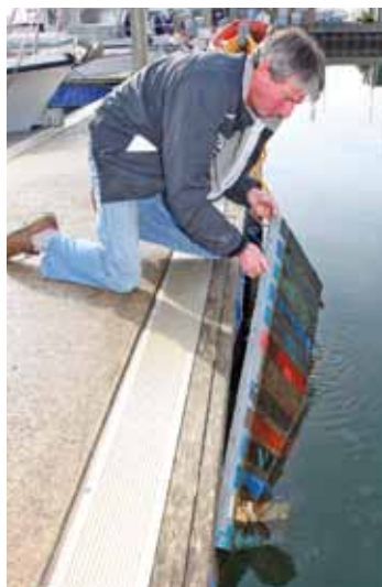
We immersed a static test panel of the 12 antifoul paints into the West Solent