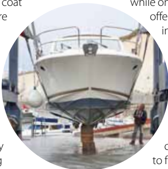
A barrier coat was first applied to Blue Fin

of the 2011 season on the south coast at Port Solent and Brighton marinas. A static test panel was also immersed at the Yacht Haven in Lympington in the west Solent.